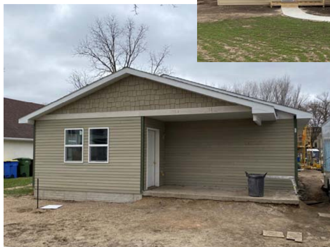
Home 76 located on Eighth Ave in Brookings.