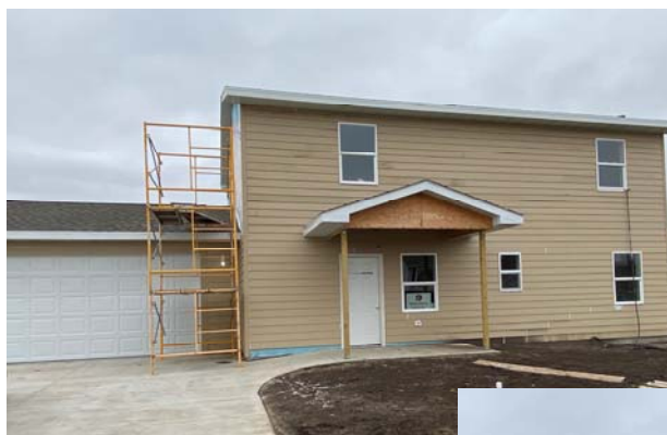
Home 74 located on Walnut Street in Aurora.

After wrapping up work and closing home 73 in February, we are continuing work to finish homes 74, 75, and 76 this spring/summer. Our Thrivent Build (home 74) has been constructed with interior work underway before our Foundation Crew and other volunteers wrap up the next project (home 75). The Brookings High School Building Trades program continues to make progress as well (home 76) as they complete garage construction before finishing the interior work. Thanks to all of our volunteers who make all of our progress possible!