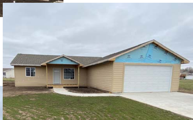
Home 75 located on Walnut Street in Aurora.